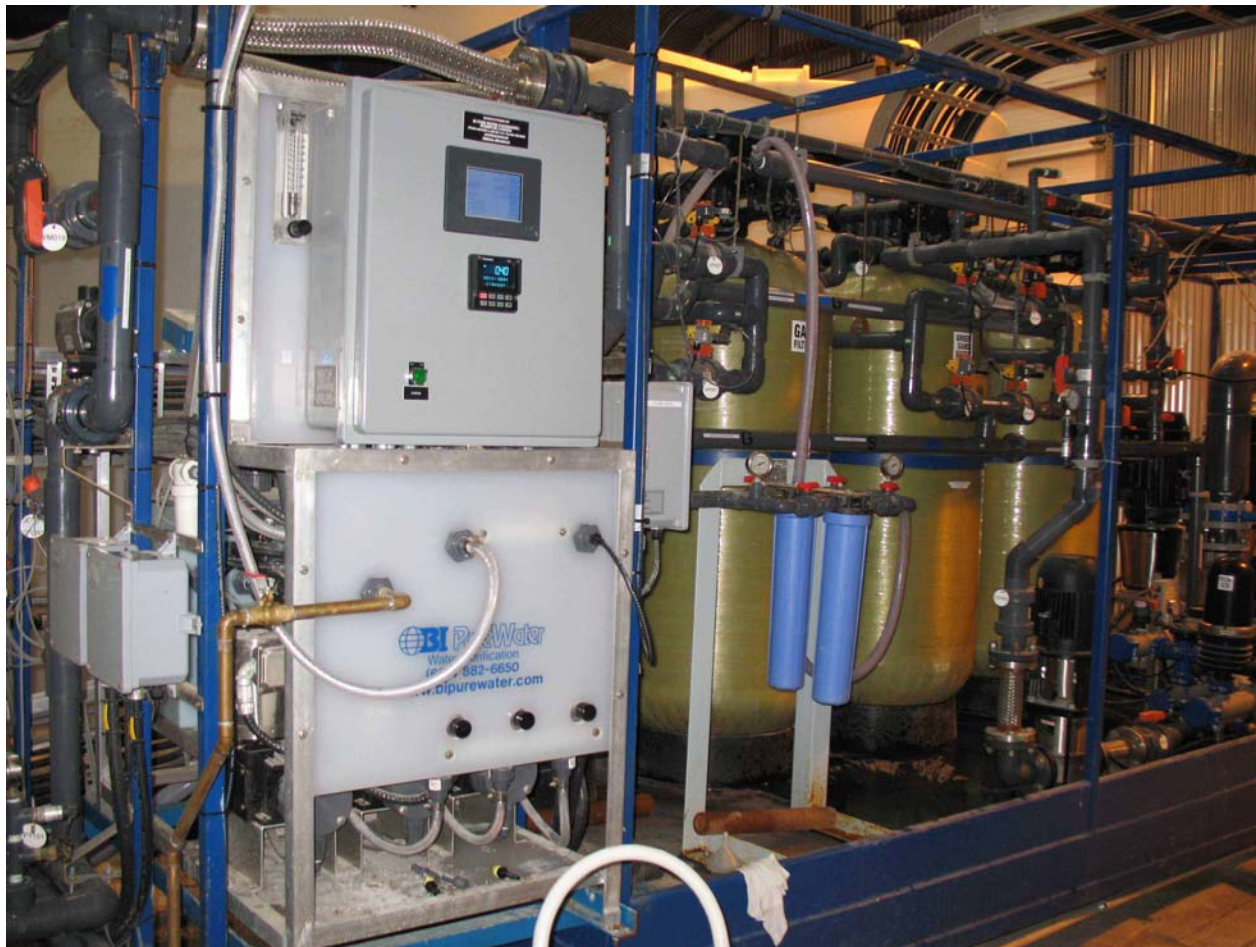
The automatic chlorination system meters a Chlorine residual into the treated water

The unit was assembled and tested at the BI Pure Water facility in Surrey, BC. Our Service Technician then travelled to the remote northern site to start and commission the system. The Chlorination system has operated well since then.