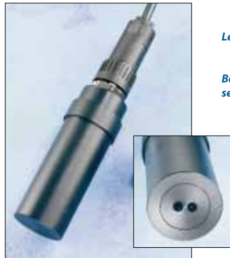
Left: Turbidity Sensor