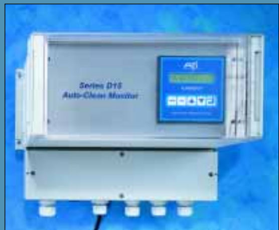
Auto-Clean Turbidity Monitor