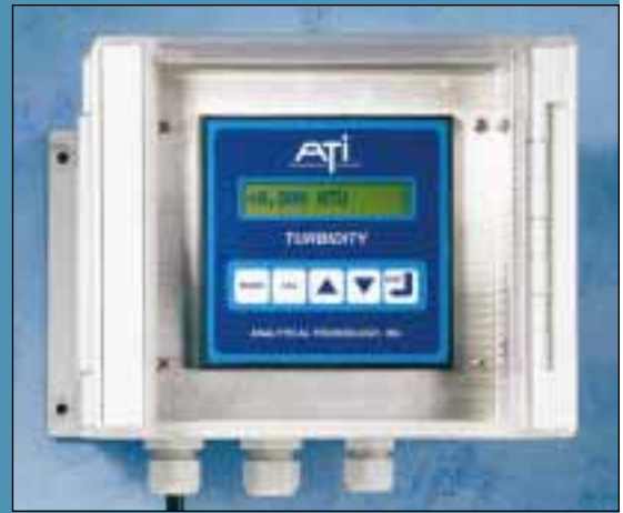
NEMA 4X Monitor

Because turbidity measurement is often required in wastewater effluents and other applications where sensor fouling can be a major problem, ATI offers a special turbidity unit, the D15/76 system, that uses an "air-blast" sensor cleaning system that automatically cleans the sensor as often as necessary to maintain reliable measurements. This system is used only for submersion applications only, and all air supply components required for the cleaning process are supplied in the NEMA 4X monitor package.