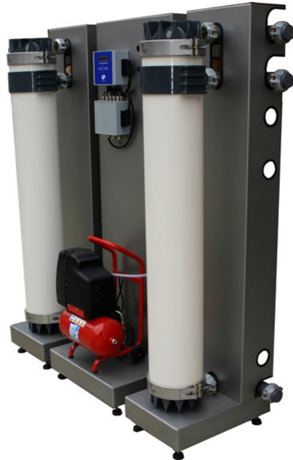
The Phoenix UF unit with dual housings.